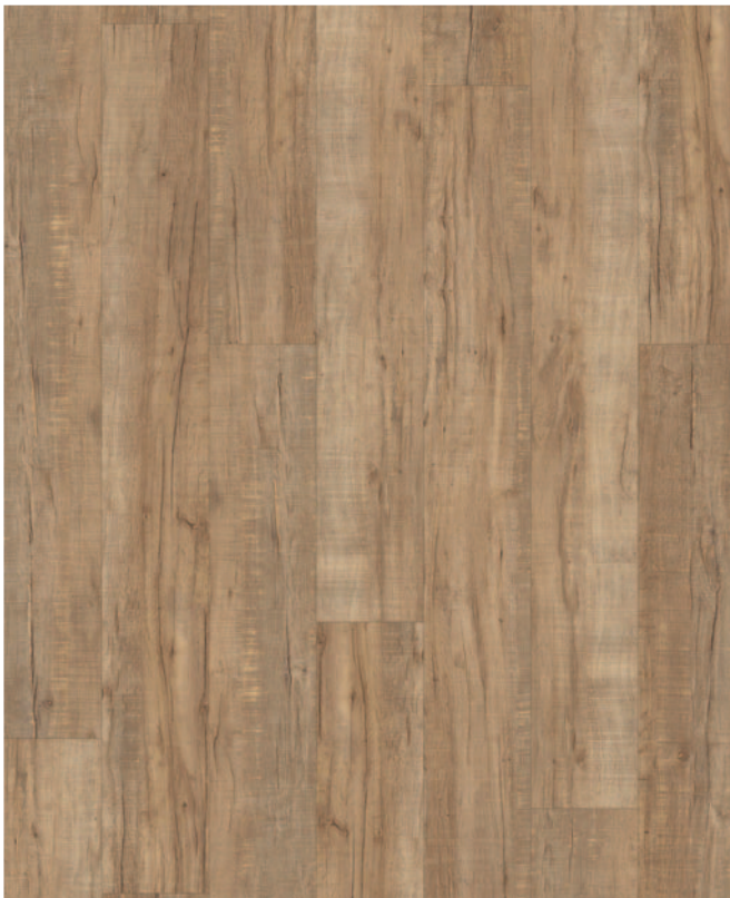
COUNTRY IRONBARK — 3L105207