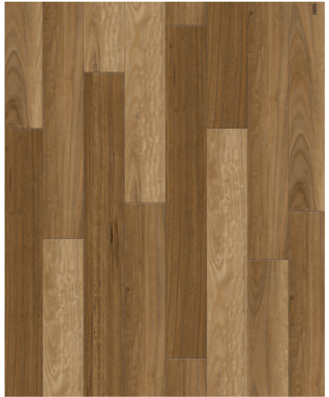
SUNRISE BLACKBUTT — 3L388901