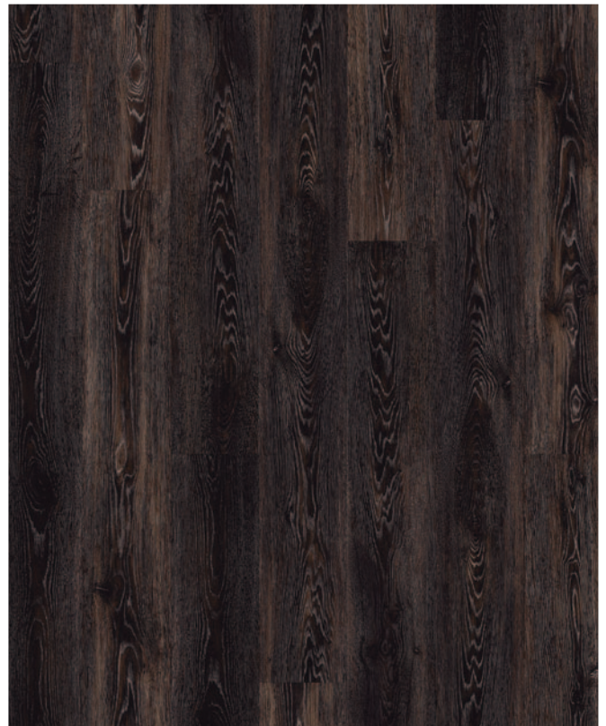
CARBON OAK — 3L165211