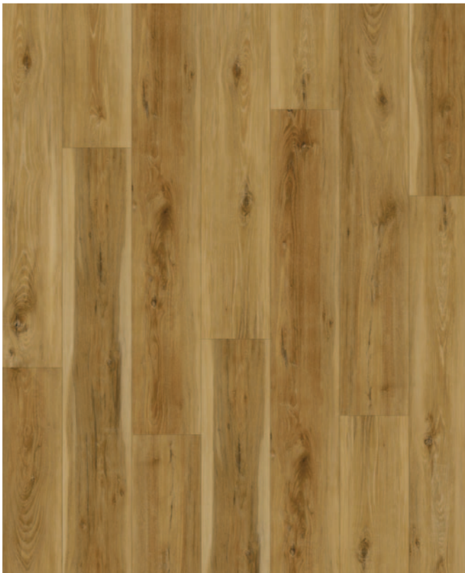
VICTORIAN ASH — 3L162240