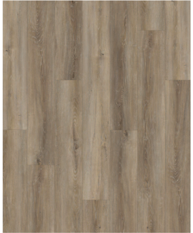
WEATHERED OAK — 3L133210