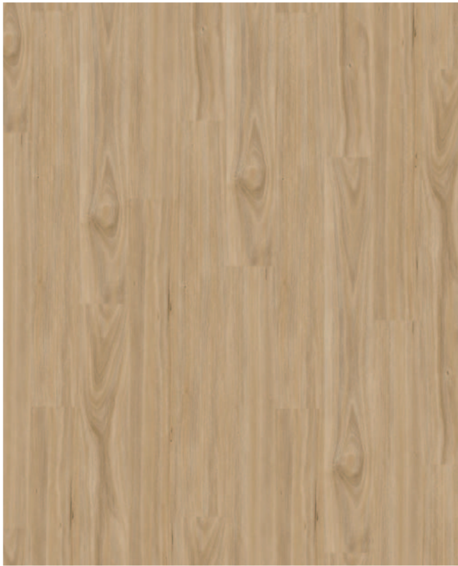
TWILIGHT TASMANIAN OAK — 3L388801