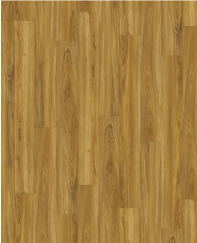
WILDWOOD CLASSIC — 3L172211