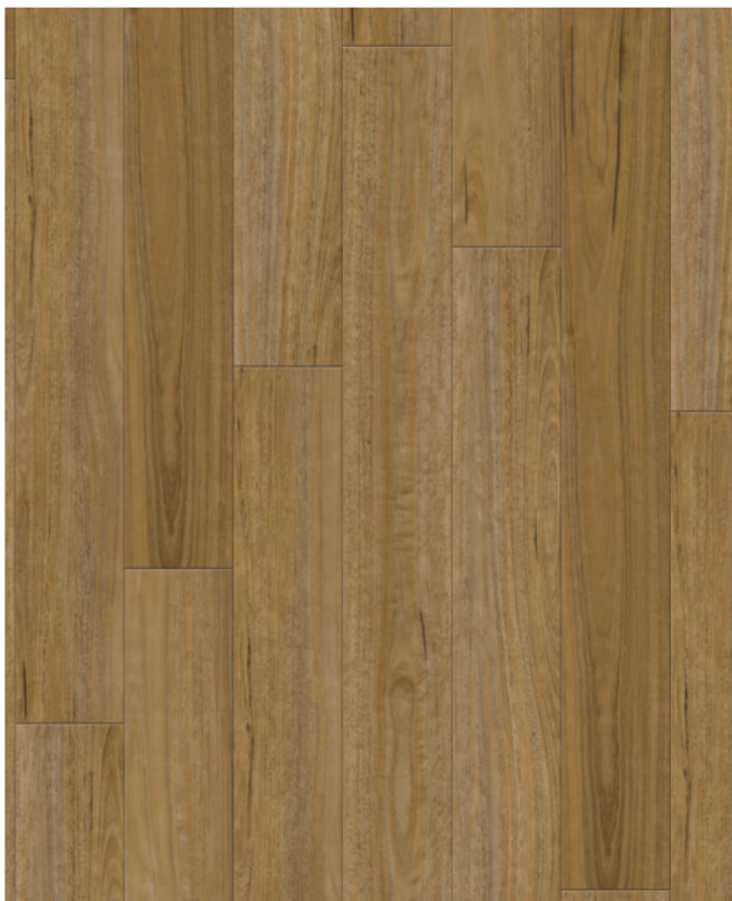
MORNING SPOTTED GUM — 3L389001