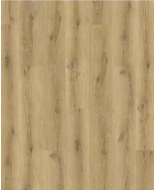
SUMMER OAK — 3L195603