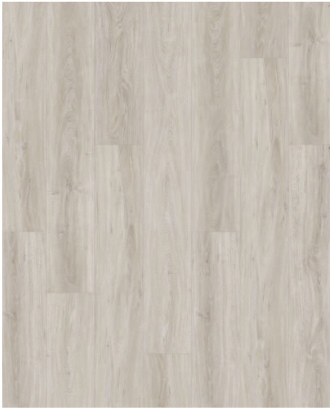
LIMED OAK — 3L111907