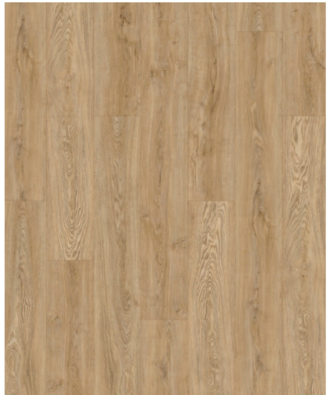
VINTAGE TIMBER — 3L111802