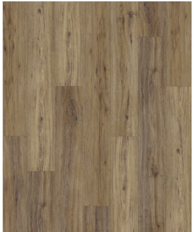
AUTUMN BARNWOOD — 3L102605