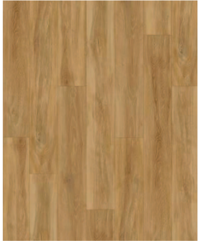
HERITAGE OAK — 3L057015