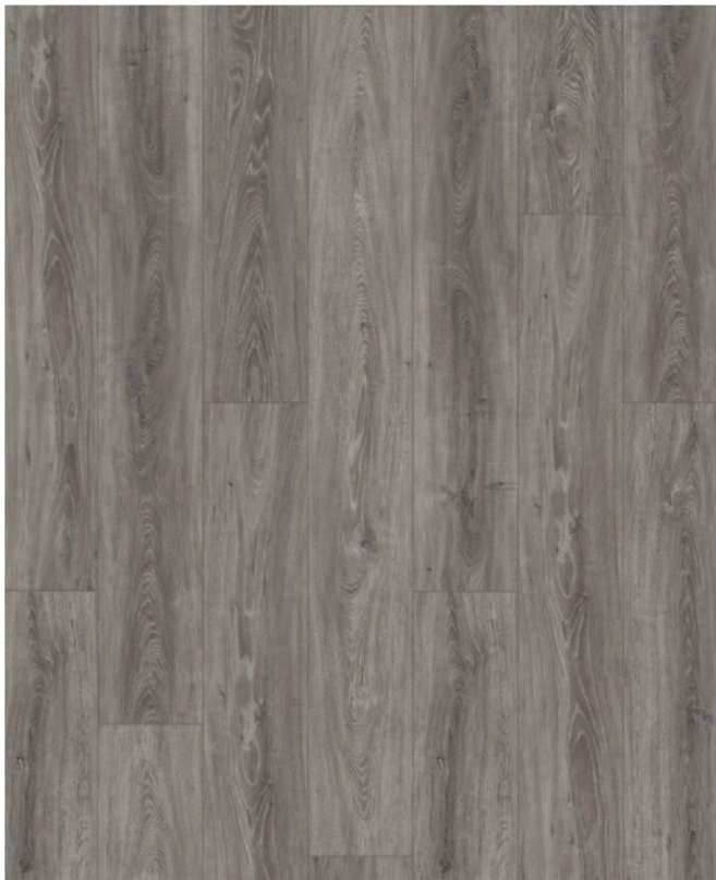
WASHED EBONY — 3L111903