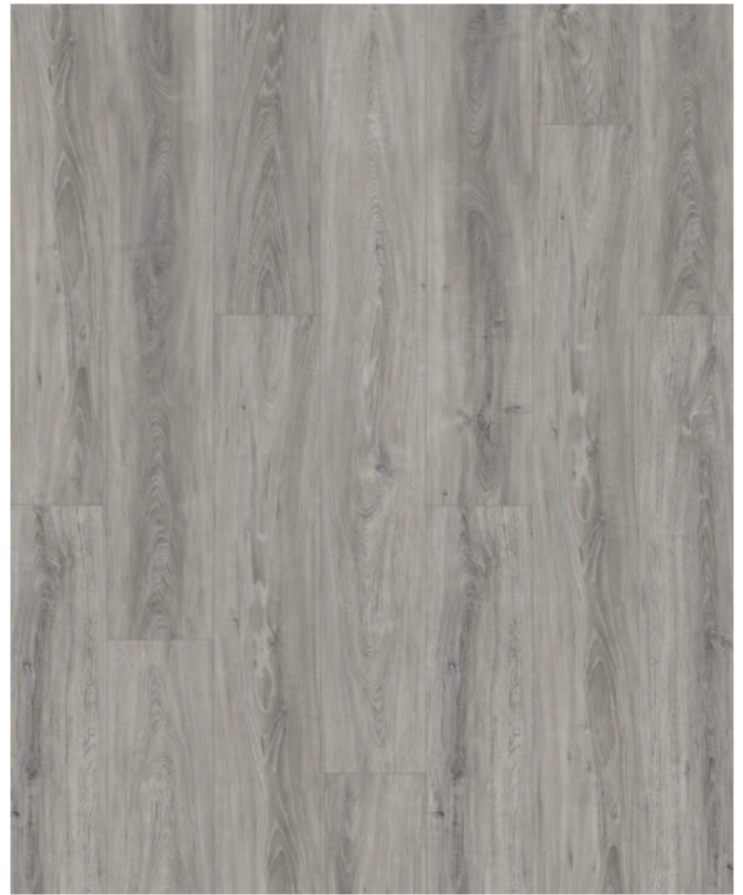
SHADOW OAK — 3L111906