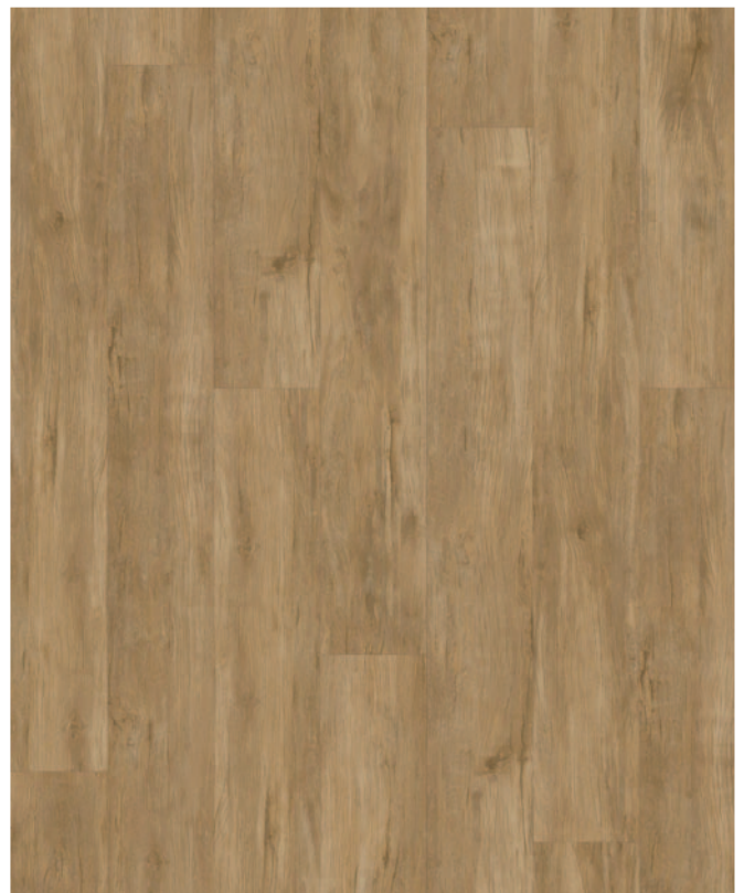
SUNSET BARNYARD GREY — 3L168011