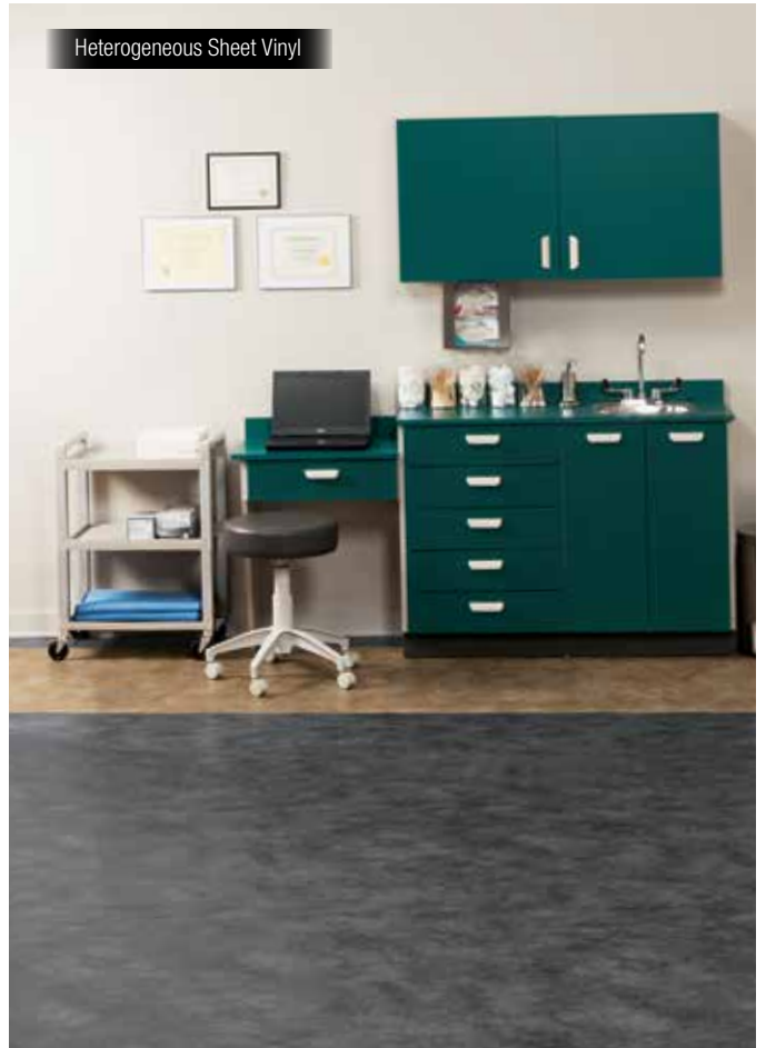
Heterogeneous Sheet Vinyl