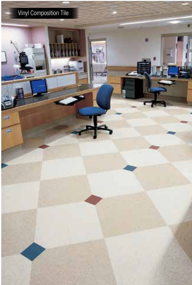
Vinyl Composition Tile