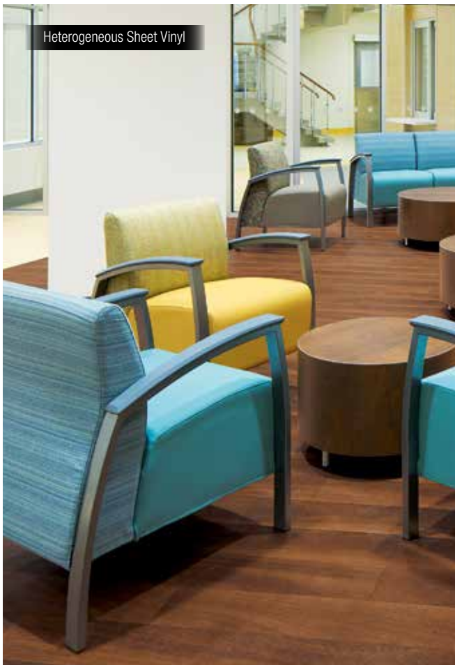
Heterogeneous Sheet Vinyl