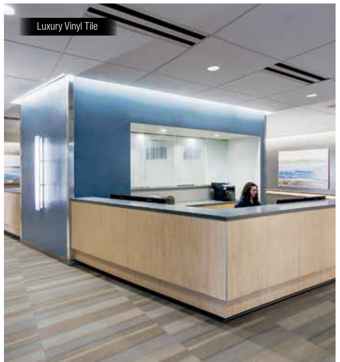
Luxury Vinyl Tile